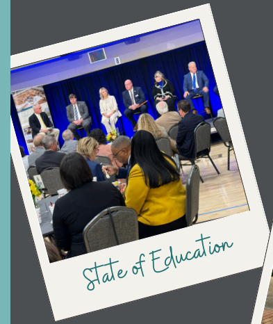
State of Education