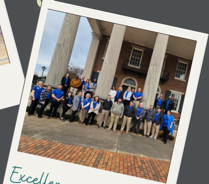
Excellence in Leadership