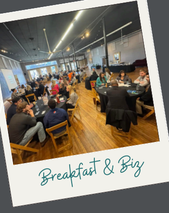
Breakfast & Biz