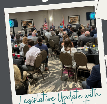
Legislative Update with Morgan Co. Delegation