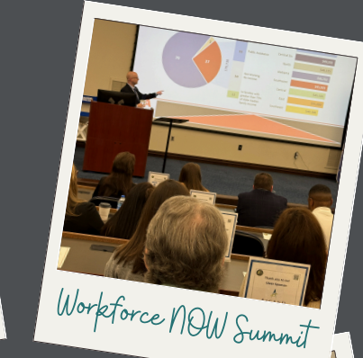
Workforce NOW Summit