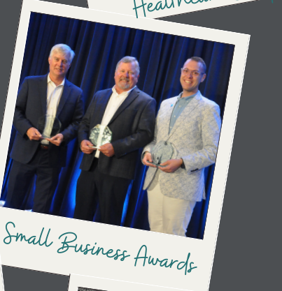
Small Business Awards