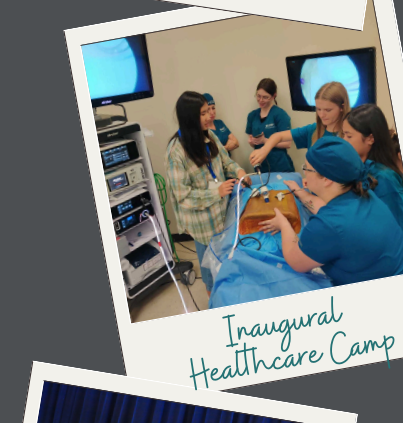
Inaugural Healthcare Camp