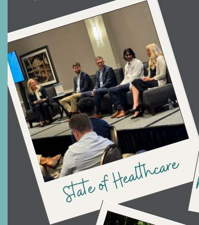
State of Healthcare