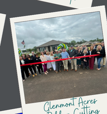
Glenmont Acres Ribbon Cutting